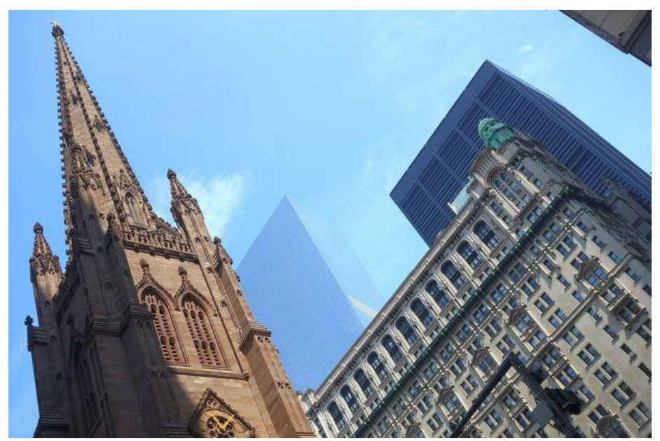
Manhattan's real estate market had a slow week leading up to Easter and Passover.

This was the third week in a row that the borough saw so few deals